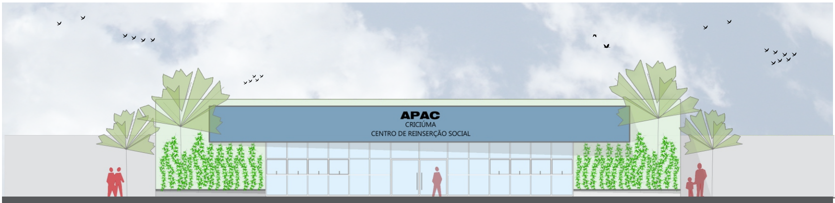
FACHADA FRONTAL ESC.:1/200