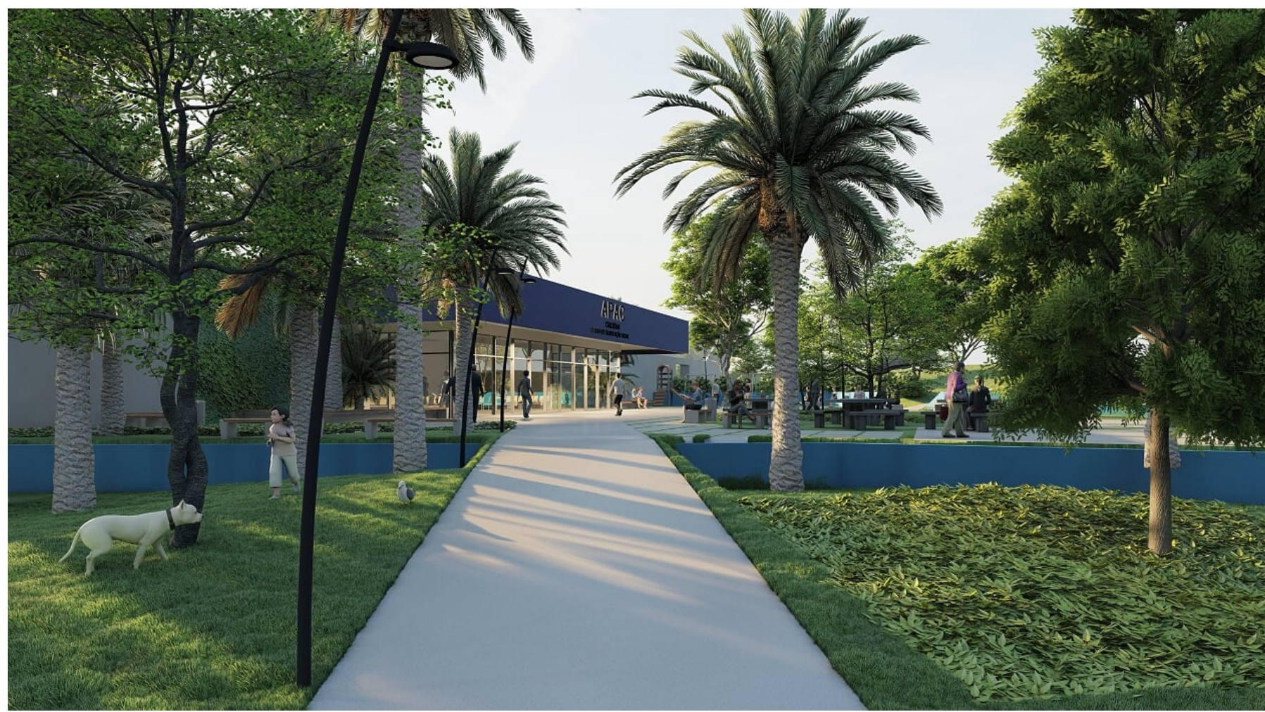
ACESSO DA PENITENCIÁRIA MASCULINA A ATÉ A APAC